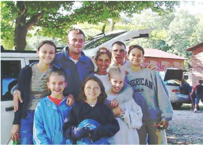
Fort Hill Campers unloading for first day of camp, setting up cabins and meeting old friends.