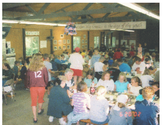
Great food and company in the dining hall.