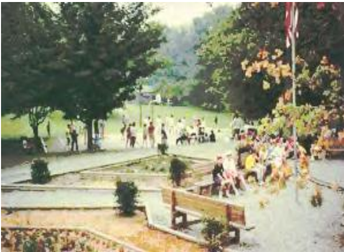
View of the flag pole, play area, basketball and volleyball courts.