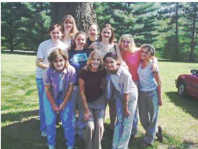
Group photos before leaving for the weekend.