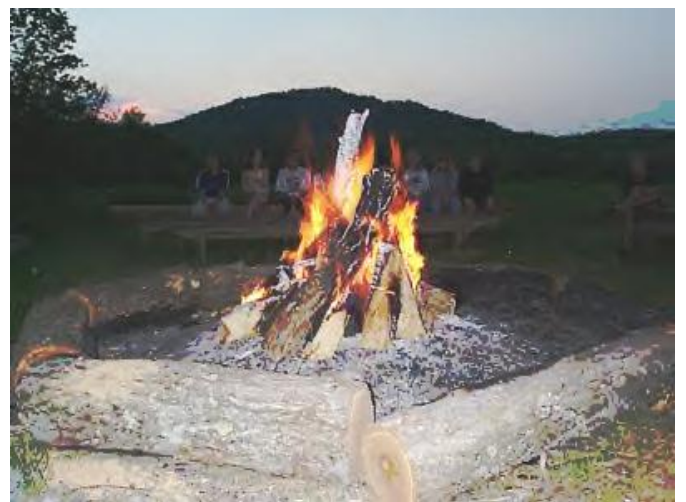
Quiet evenings surrounded by beautiful hills and a glowing sunset for evening devotionals.