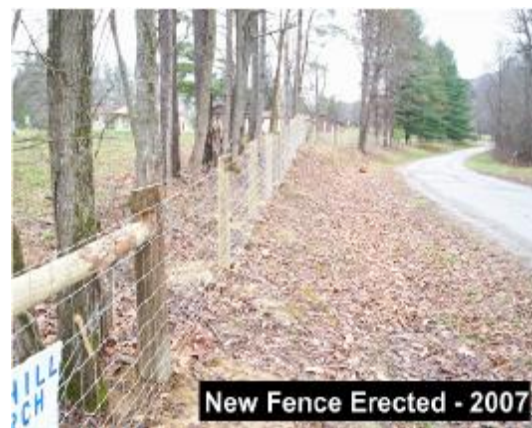
New Fence Erected - 2007

FOR INFORMATION AND PHOTOS ABOUT FORT HILL CAMP: www.forthillcamp.org