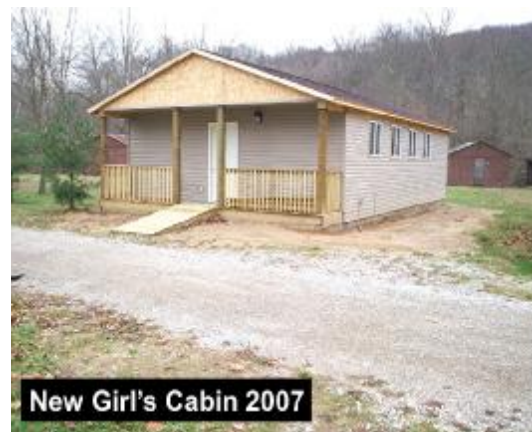
New Girl's Cabin 2007

The new fence is a heavy woven wire type with round wood posts spaced 8 feet apart. This fence will provide some security and is an attractive addition to the property. Both the fence and cabin were funded by a generous donor.