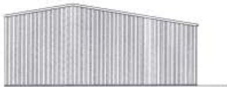
4 NORTH ELEVATION SCALE 1/8"=1'-0"