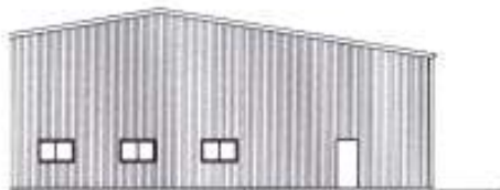
5 SOUTH ELEVATION SCALE 1/8"=1'-0"