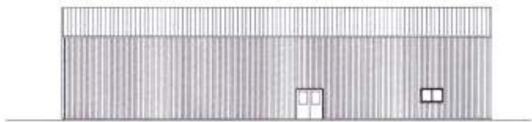
2 WEST ELEVATION SCALE 1/8"=1'-0"